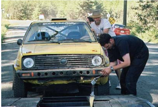
Doesn't look too bad.