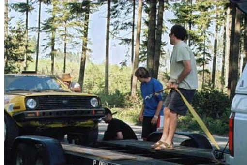
Make physics work for you.