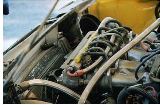
No we didn't get away with it. Notice the curvy radiator.